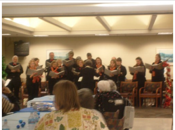
The Just For Fun Singers at last Year's Holiday Party

not being monitored when they use the computers.