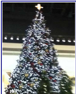
The tree in the IDS Center crystal court