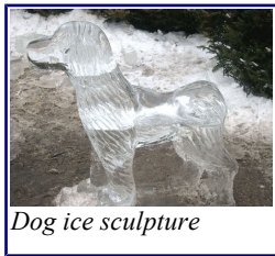
Dog ice sculpture

January 21st- Seal Holiday Dinner. 6:00PM