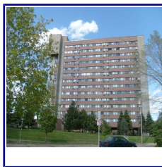
Our Home Sweet Home

Looking back on the past year I see that a lot of good things happened in the building. There also were a number of things that needed to be worked on.